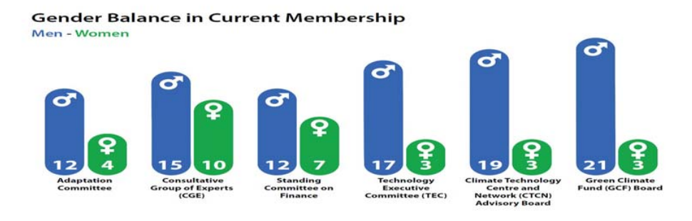
Figure 2 Women in high-level decision-making positions in UNFCCC boards and bodies